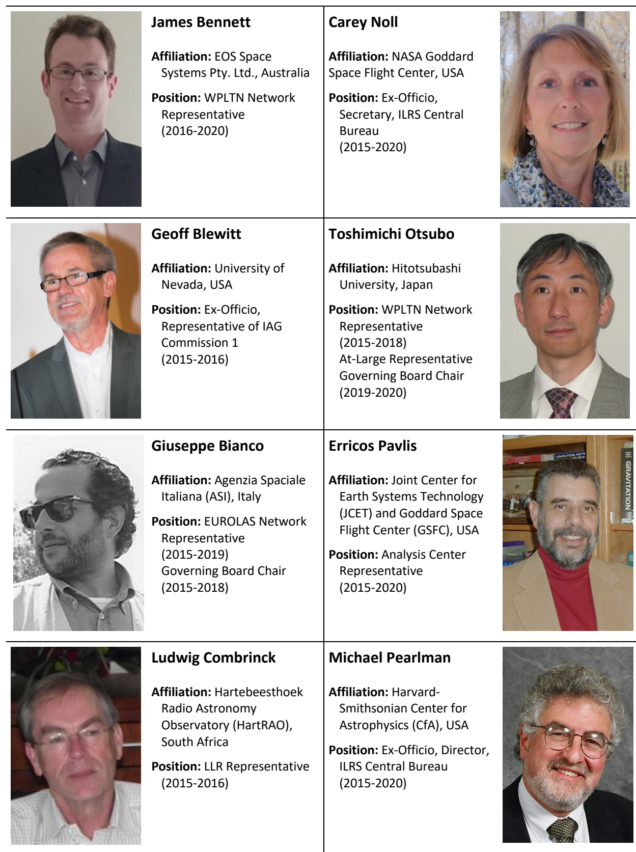
Table 3-1. ILRS Governing Board (2015-2020)