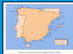
Coastal Meteorological Service