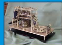
1928: Transmisión de señales horarias