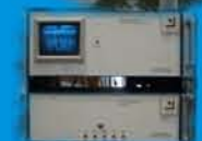
1986: GPS time transfer by Common View technique