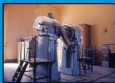
1952: Circulo Meridiano Grubb Parsons