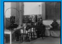
1915: Recepción de señales horarias