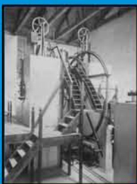
1864: Circulo Meridiano Troughton