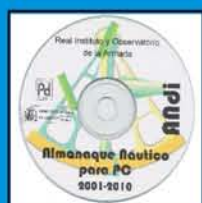
1998: Almanaque Náutico para PC