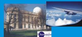
1977: Time transfer by flying clock