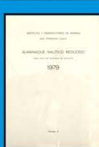
1979: Almanaque Náutico Reducido