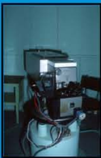
1968: Rotación de la Tierra