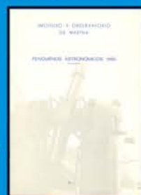
1980: Fenómenos Astronómicos