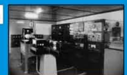
1958: Quartz Oscillators