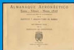
1945: Almanaque Aeronáutico