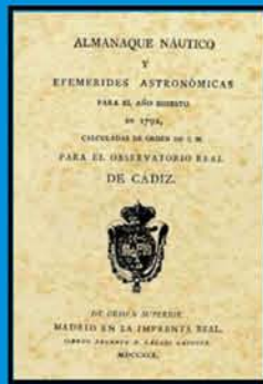
First Spanish Nautical Almanac