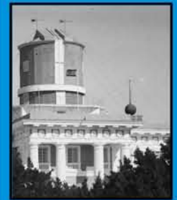
1878: Bola de señales Horarias