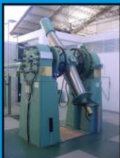
CMASF "El Leoncito" (Argentina)