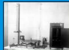
Nº 6 Milne Pendulum