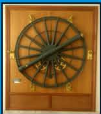
1831: Circulo Mural Jones