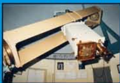
1887: Astrógrafo Gautier